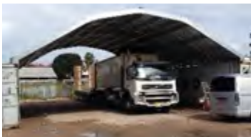
Storage for vehicles, boats, & Warehouse Storage equipment