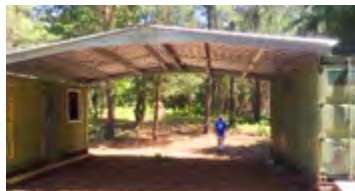
General Shelter for People & Livestock