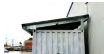
Roof Cover for extended Warehouse Storage