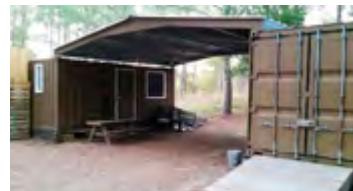
Hunting shelters, Cabin, or even a Home